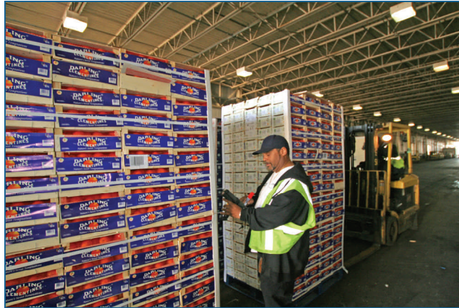
Pallets of Moroccan clementines destined for US markets scanned prior to cold treatment

Unlike Canada, the US agricultural regulations require citrus imports from Morocco to be cold treated (CT) to protect the US domestic citrus crops from the Mediterranean fruit fly. During prior seasons, FFM's fruit for the US market was shipped in refrigerated containers. However, to improve delivery time to market this season FFM requested that the Port CT its fruit.