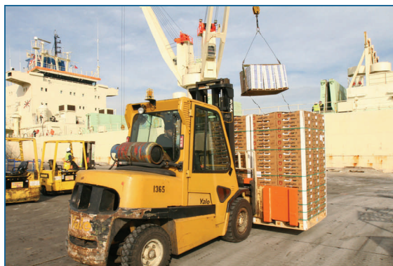
Chilean grapes discharged off M/V Hansa Stockholm , the first vessel of the season

The Port of Wilmington is a leading US port of entry for imported Chilean fruit, and last winter it handled over 160,000 pallets of various type of fruit, the majority of