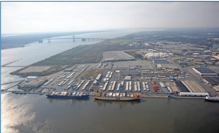
In FY 2011, the number of ship calls at Delaware's Port and the total cargo throughput increased by 5% acceding 4.43m tons.

...We anticipate additional shipments in 2012 as NASA prepares for its first launch.